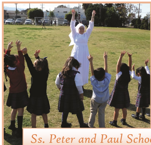
Ss. Peter and Paul School

We are called to be “prepared for every good work.” In our parish communities we give