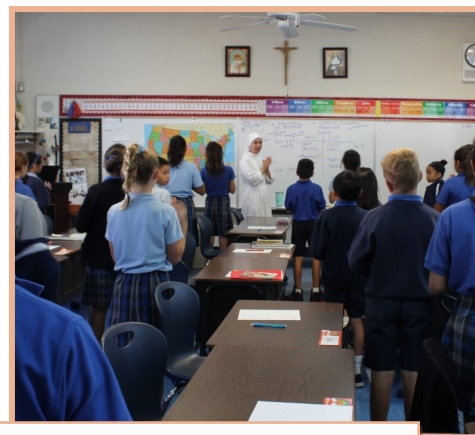
St. John the Baptist School

life. Whether in the classroom, with the poor, or in the bookstore, our mission is the same: to pray for and serve the Church by showing the love of Christ to all we meet.